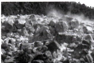
Sulphur Banks Trail